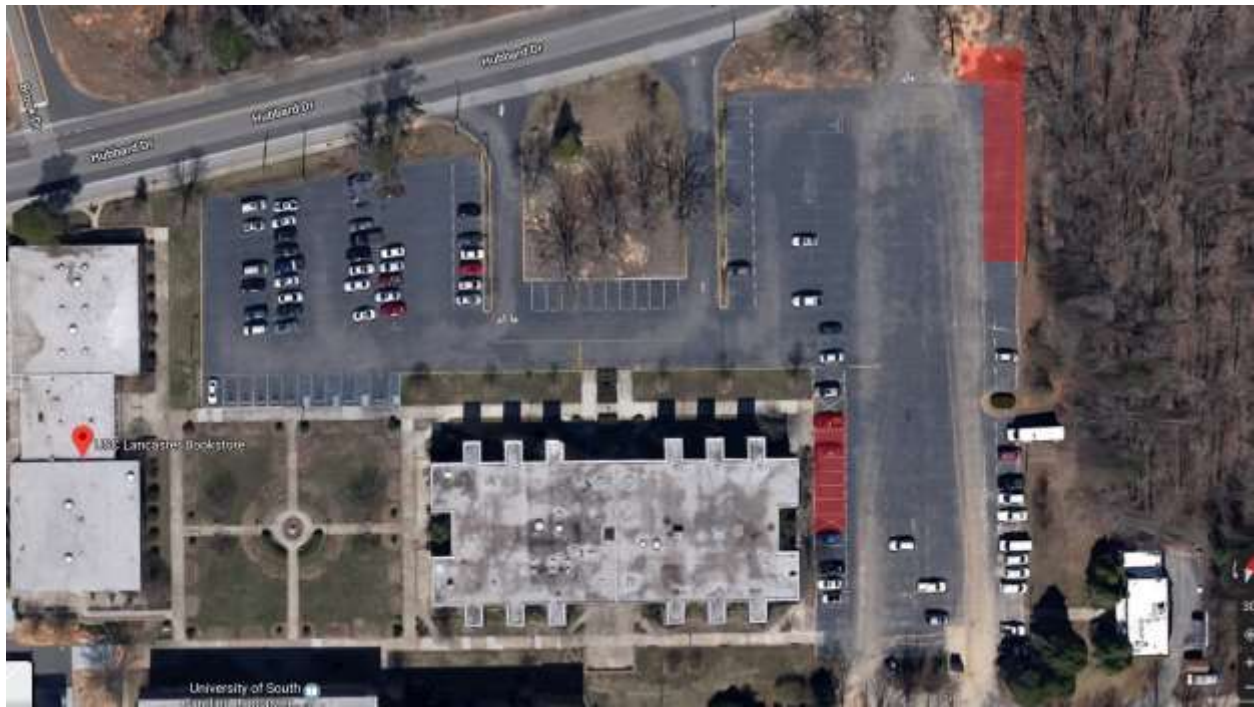
Figure 1: Approved Staging and Storage Areas